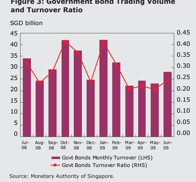
Figure 3: Government Bond Trading Volume

On 7 May 2009, MAS issued a set of Guidelines on the Application of Banking Regulations to Islamic Banking. The guidelines consolidated the previous regulations and clarifications issued by MAS, and offered specific information on the regulatory treatment of various Islamic structures. The